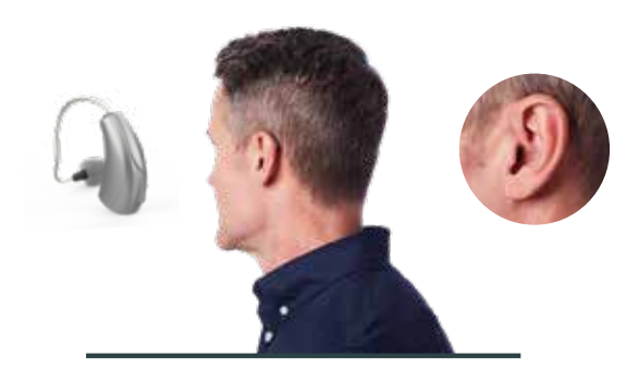
micro RIC micro Receiver-In-Canal