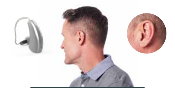
RIC 312 Receiver-In-Canal